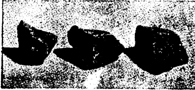
FIG. 3 PARTICLE SHAPE: ANGULAR