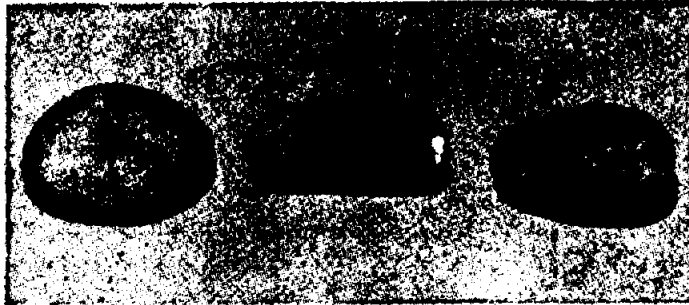
FIG. 1 PARTICLE SHAPE: ROUNDED